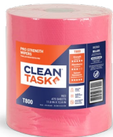
Clean Task® Pro Strength T800 Wipers, Jumbo Roll, Red

#88350 | 11.8" x 12.8" Sheet Size 475 Sheets/Package 1 Roll, 475 Sheets/Case