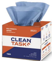
Clean Task® Pro Strength T800 Wipers, Double-Take® Pop-Up Box, Blue

#88251 | 9.5" x 16.5" Sheet Size 140 Sheets/Package 1 Box, 140 Sheets/Case