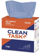
Clean Task® Pro Strength T700 Wipers, Pop-Up Box, Blue

#78200 | 8.3" x 16.1" Sheet Size 100 Sheets/Package 8 Boxes, 800 Sheets/Case