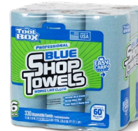
TOOLBOX® Shop Towels, 6 Pack, Blue #54416 | 11" x 9" Sheet Size 330 Sheets/Package 4 Packs, 1,320 Sheets/Case