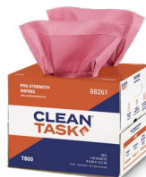
Clean Task® Pro Strength T800 Wipers, Double-Take® Pop-Up Box, Red

#88251 | 9.5" x 16.5" Sheet Size 140 Sheets/Package 1 Box, 140 Sheets/Case