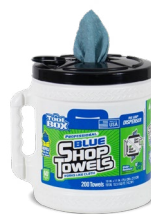
TOOLBOX® Shop Towels, Big Grip® Dispenser, Blue #55208 | 10" x 11" Sheet Size 200 Sheets/Package 2 Dispensers, 400 Sheets/Case