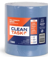
Clean Task® Pro Strength T800 Wipers, Jumbo Roll, Blue

#88261 | 9.5" x 16.5" Sheet Size 140 Sheets/Package 1 Box, 140 Sheets/Case