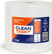
Clean Task® Pro Strength T700 Wipers, Jumbo Roll, White

#78250 | 8.3" x 16.1" Sheet Size 100 Sheets/Package 8 Boxes, 800 Sheets/Case