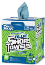
TOOLBOX® Shop Towels, Box, Blue #55202 | 10" x 11" Sheet Size 200 Sheets/Package 6 Boxes, 1,200 Sheets/Case