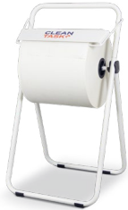
Jumbo Roll Floor Stand Dispenser #99911 | 16.45" x 17.4" x 33.07" 1 Dispenser/Case

Designed for seamless compatibility, all Clean Task® DRC Jumbo Rolls work with our Jumbo Roll stands. The rugged Floor Stand moves easily between work areas, while the Wall Mount ensures wipers stay right where they're needed.