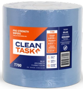
Clean Task® Pro Strength T700 Wipers, Jumbo Roll, Blue

#78300 | 11.8" x 12.8" Sheet Size 870 Sheets/Package 1 Roll, 870 Sheets/Case