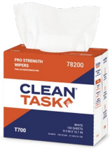
Clean Task® Pro Strength T700 Wipers, Pop-Up Box, White

#78200 | 8.3" x 16.1" Sheet Size 100 Sheets/Package 8 Boxes, 800 Sheets/Case