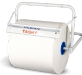
Jumbo Roll Wall Mount Dispenser #99914 | 16.53" x 11.2" x 15.75" 1 Dispenser/Case