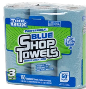
TOOLBOX® Shop Towels, 3 Pack, Blue #54483 | 11" x 9" Sheet Size 165 Sheets/Package 8 Packs, 1,320 Sheets/Case